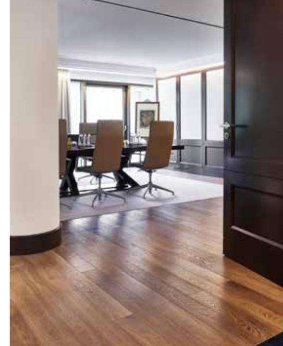
A wooden floor also creates a quiet, homogeneous atmosphere in the conference rooms.