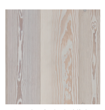
Douglas Cathedral light