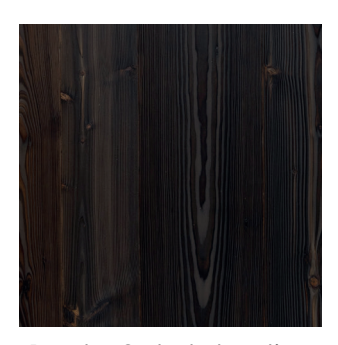
Douglas Cathedral medium