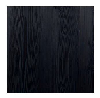
Douglas Cathedral dark